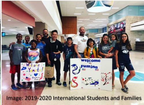
Image: 2019-2020 International Students and Families