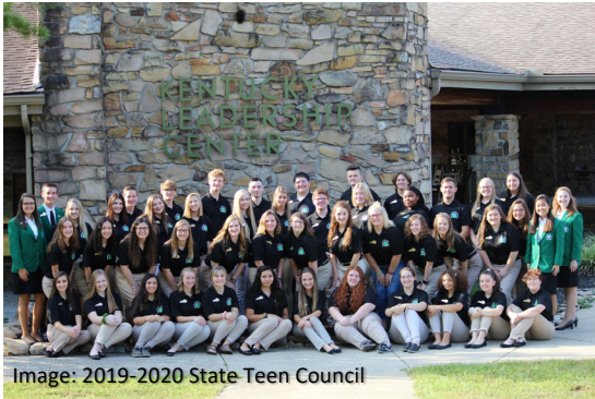
Image: 2019-2020 State Teen Council